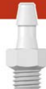
10-32 UNF Special Tapered Thread PG-111 1/4-28 UNF PG-114