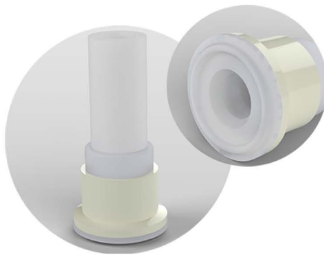
DN 20 TC