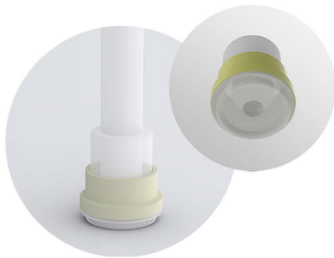
3/4" TC MINI

For Pharmaceutical and Biotech Applications