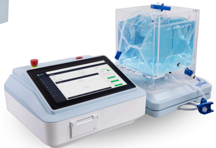
MiniDuoMixer® (2 - 20L) ▼