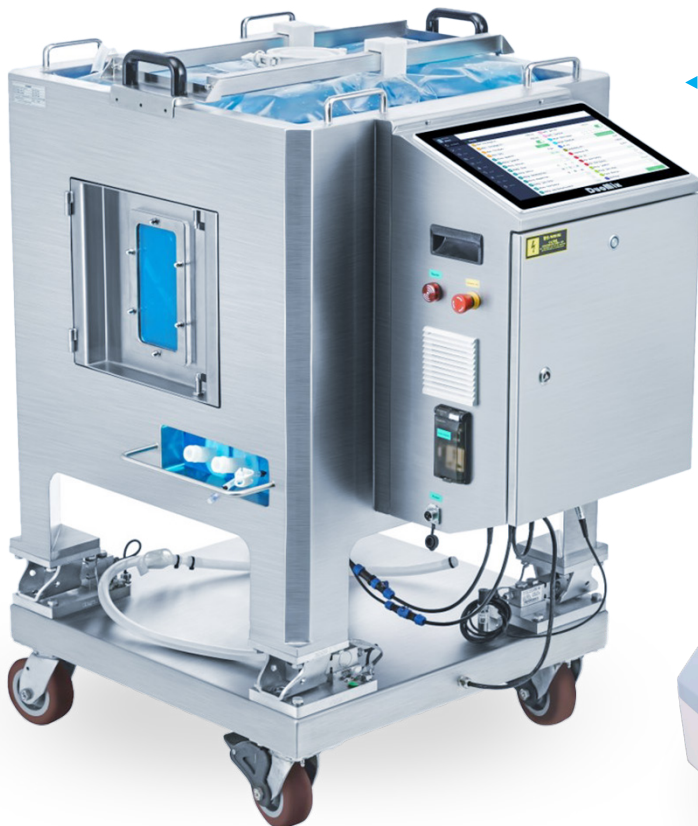
◀ DuoMixer® (50 - 3,000L)