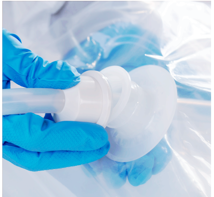
DPTE® BETA BAG WITH HOSE BARB PORTS

Elevate your confidence in the integrity of your sterilizing filters by implementing one of our configurable pre-use post sterilization integrity testing (PUPSIT) designs with a filter of your choice. Our agnostic component library allows for freedom of design and ensures a perfect fit for your specific process.