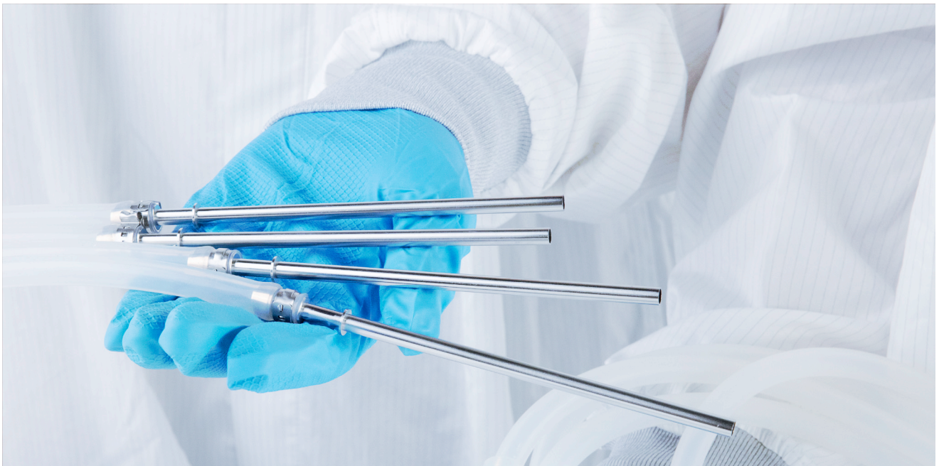
ACCURATE DOSING NEEDLES FIT TO YOUR BRAND FILLER