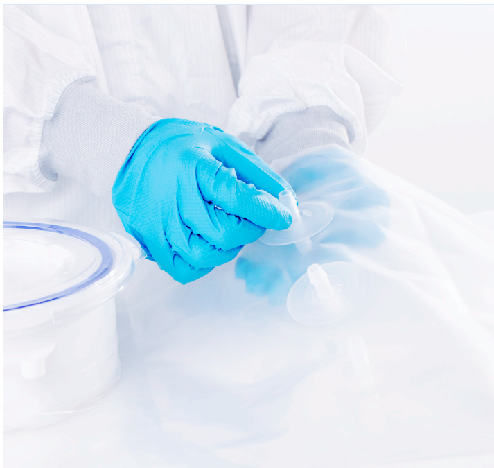
DPTE® BETA BAG WITH HOSE BARB PORTS