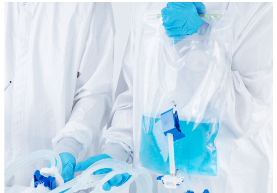
CUSTOM DESIGNED SURGE BAG FOR PRODUCT RECOVERY