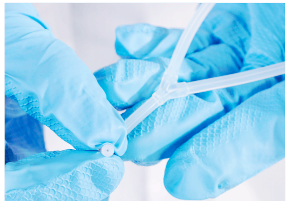
OVERMOLDED MICRO WYE WITH A 1/32" ID FOR PRECISE FLUID TRANSFER APPLICATIONS