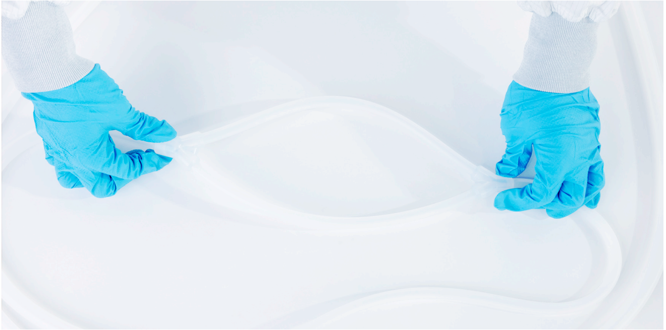
OVERMOLDED DOSING PUMP LOOP, MICRO BORE SIZES AS SMALL AS 0.032 IN. (0.76MM) ID, COMPATIBLE WITH MULTIPLE PUMP TUBING BRANDS AND DUROMETERS