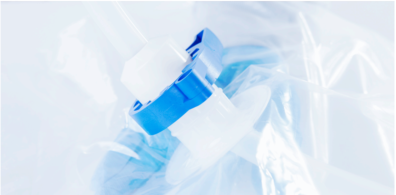
OVERMOLDED THRU TC ON BETA BAG