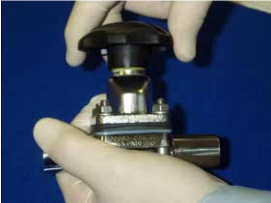
Moulded Closed 214S/425