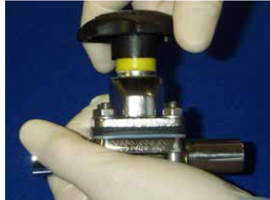
Moulded Open 214/425

13. Tighten all fastenings to the specified torque setting (see torque spec tables), as per Figure 1.